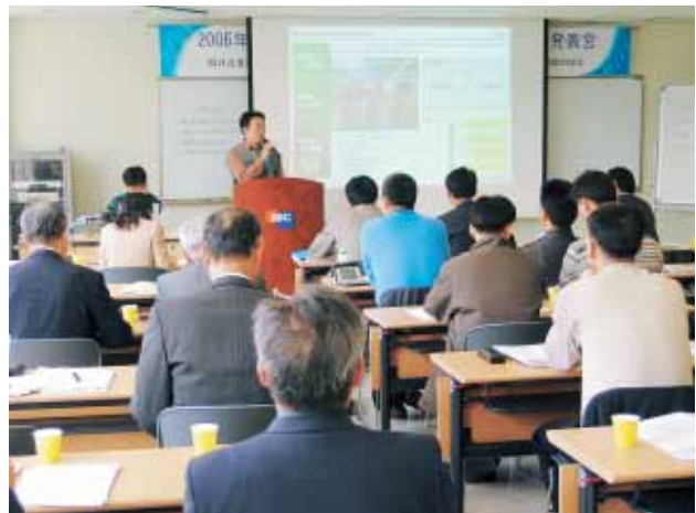
a scene from the seminar