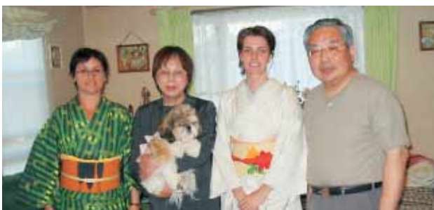
guests wearing Kimono