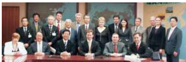
Chelyabinsk Mission made a courtesy visit to Mayor of Kitakyushu