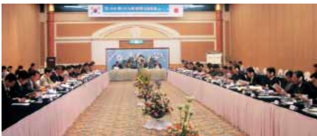
the 14 th Japan(Kyushu)-Korea Economic Exchange Conference