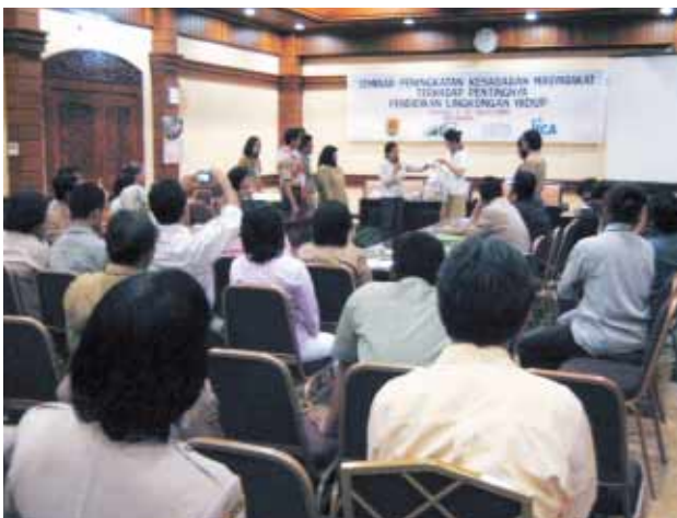
environmental education course for community residents