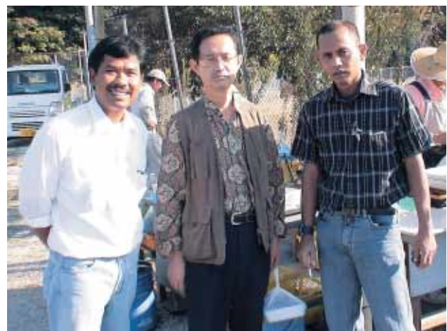
with guests from Indonesia at suburban orchard