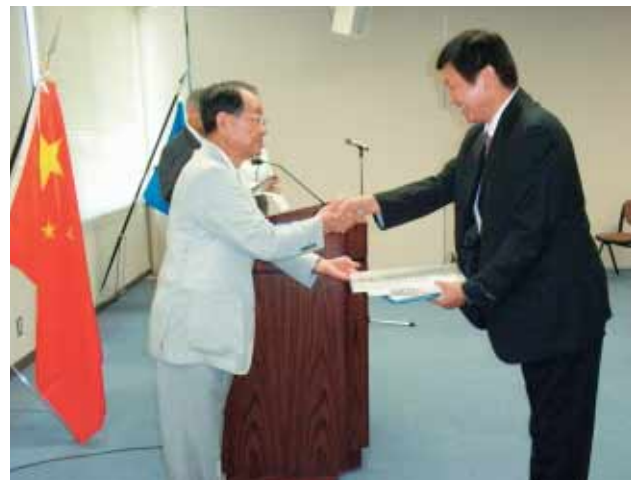
at closing ceremony of KITA/JICA training course