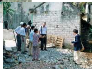
neighbor is complaining waste water problem