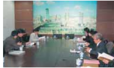
conference with Suzhou Environmental Protection Bureau

Finally, the study team would like to recommend City of Suzhou had better to specifically select Electronics and Electric Industries which dispose high grade and adequate quantities of waste plastic materials as a typical model case in Recycle Industry.