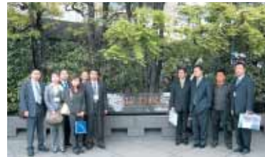
in front of JBIC

We hope that this training can contribute to the water environment improvement of Kunming City.