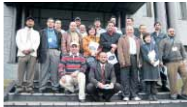
after training, with every participants and coordinators

All participants finished the training and thanked lecturers, and went back home safely.