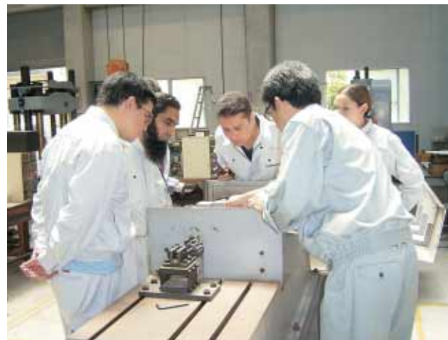
practical training on Fatigue Test at Fukuoka Industrial Technology Center