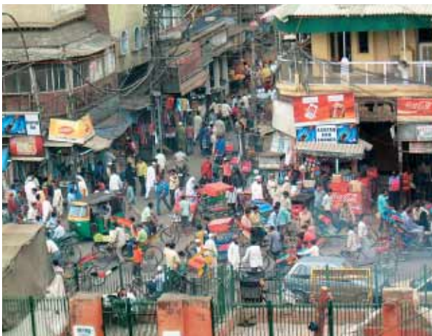
a crowd in a bazaar in Old Delhi