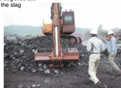
collecting iron from a large stock of slag