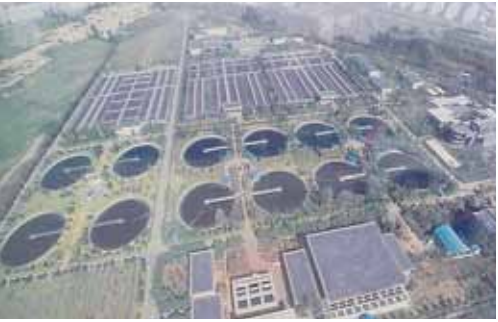
Bird's-eye view of the No. Seven and No. Eight sewage treatment plants

ianchi Lake, located south of Kunming, the capital city of Yunnan, China was once also known as the Jewel of the Plateau, but its water quality has so deteriorated that it can no longer be used even for agricultural purpose owing to the eutrophication caused by the ever-increasing inflow of untreated sewage to Dianchi Lake that has accompanied economic growth. Dianchi Lake is counted as one of the "three rivers and three lakes", the synonym for the environmental pollution of China, and was designated by the Chinese government as a priority region for environmental conservation.