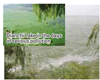
Dianchi Lake in the present day

A follow-up survey was implemented after the course had finished, which found that the No. Seven sewage treatment plant (JICA-ODA) was being properly operated and managed, and that a new water conduit had been laid to Dianchi Lake with which replacement of the lake water was being carried out. Treated water from the sewage treatment plants was said to be being discharged outside of Dianchi Lake, which made us believe that the water quality of Dianchi Lake would be so improved that the "Jewel of the Plateau" would be restored in the near future. Lastly, a certificate of confirmation was signed to confirm the completion of the course and the continuation of an amicable collaborative relationship in the future.