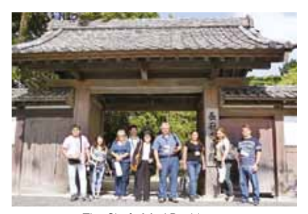
The Chofu Mori Residence