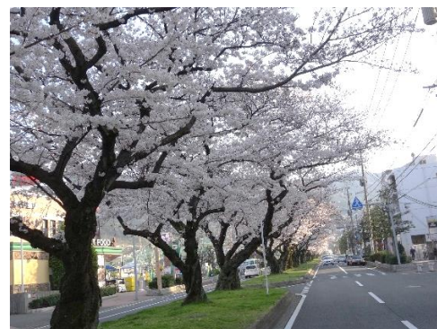
A road lined with Sakura trees near JICA Kyushu