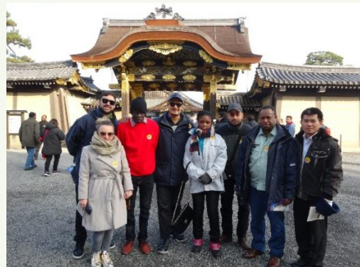
At Nijo Castle with group members