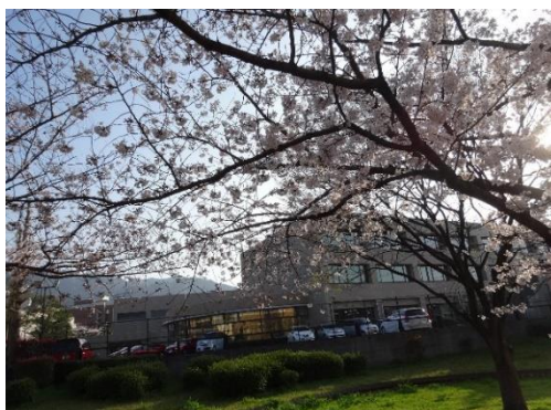
Sakura trees in front of JICA Kyushu Center