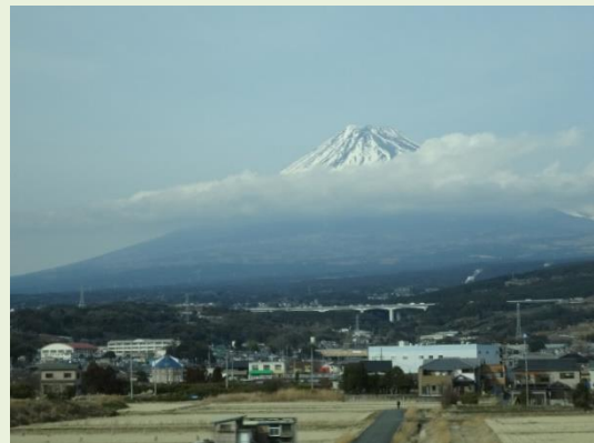
They could see a wonderful Mt. Fuji from inside the car