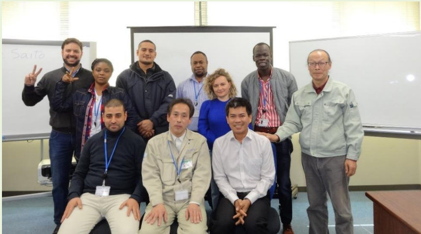
The memorial photo after lecture