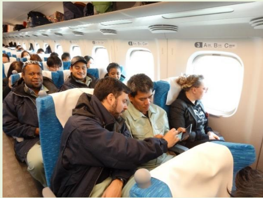
Participants moving on Shinkansen