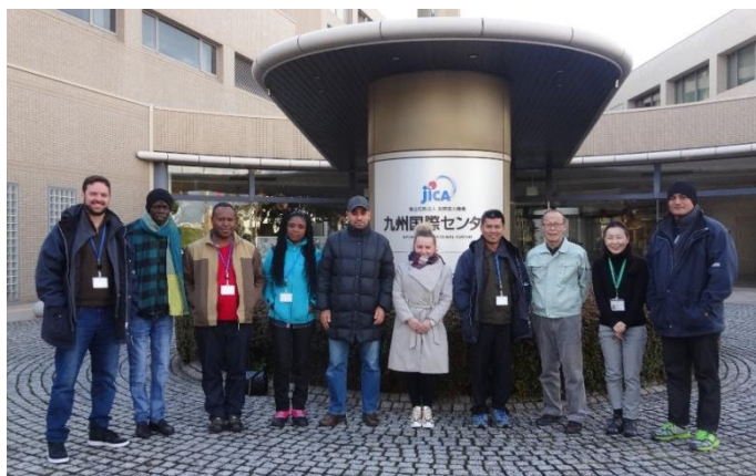
Participants at the JICA Kyushu Center Entrance.

I guess that all his learning from the training was fresh for him, who had just started sewerage project. He asked a question repeatedly until he could fully understand, and kept this attitude throughout the training. Sometimes, his question caused a laugh from other participants but his character shared the laugh with each other and it led to soften the training and make a good teamwork. I expect he would contribute to promoting sewerage project in Cambodia keeping on with his hard work and approach to soften a team.