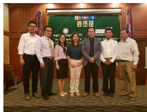
Action Plan presentation held in Battambang city