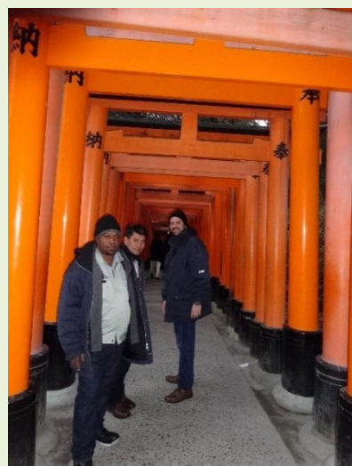
In torii gates of Fushimi Inari Shrine in Kyoto.