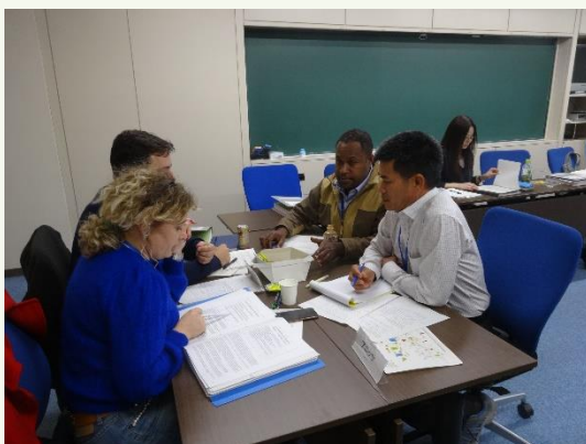
Discussion with group members during "Weekly Review Time" during training course