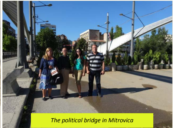
The political bridge in Mitrovica