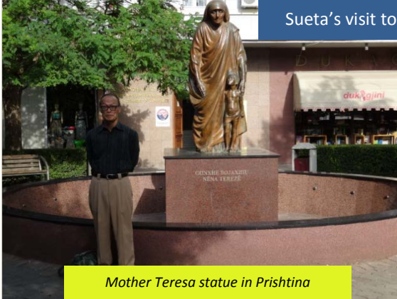
Mother Teresa statue in Prishtina