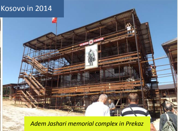
Adem Jashari memorial complex in Prekaz