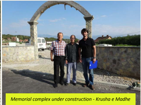
Memorial complex under construction - Krusha e Madhe