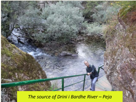
The source of Drini i Bardhe River - Peja