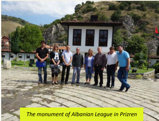
The monument of Albanian League in Prizren