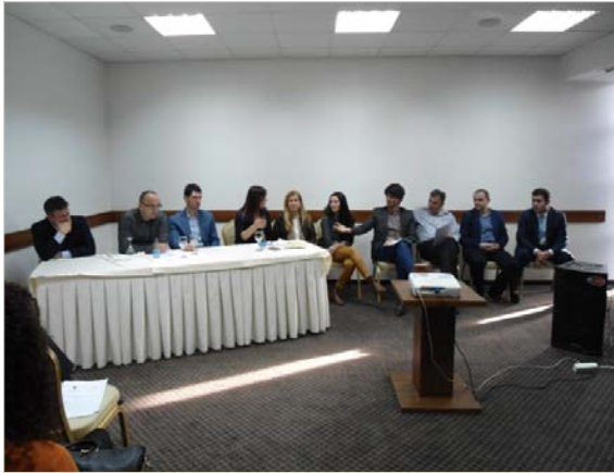
Photos during the last seminar held in Prishtina